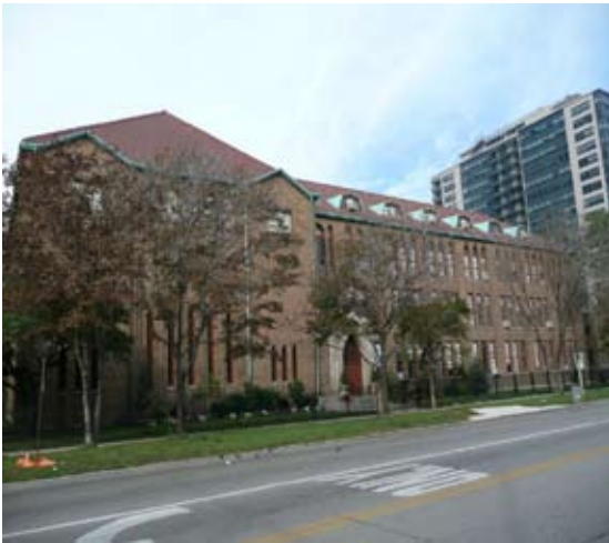
Lycée Français de Chicago