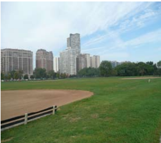
Lincoln Park (4 baseball fields)