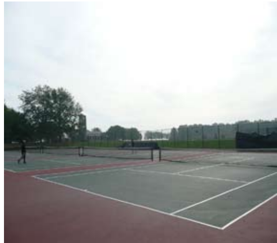
Lincoln Park Tennis Courts